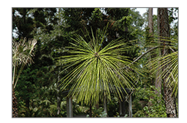
Longleaf Pine foliage