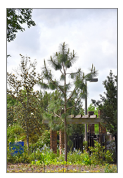
Longleaf Pine

This tree will require occasional maintenance and upkeep. When pruning is necessary, it is recommended to only trim back the new growth of the current season, other than to remove any dieback. Gardeners should be aware of the following characteristic(s) that may warrant special consideration;