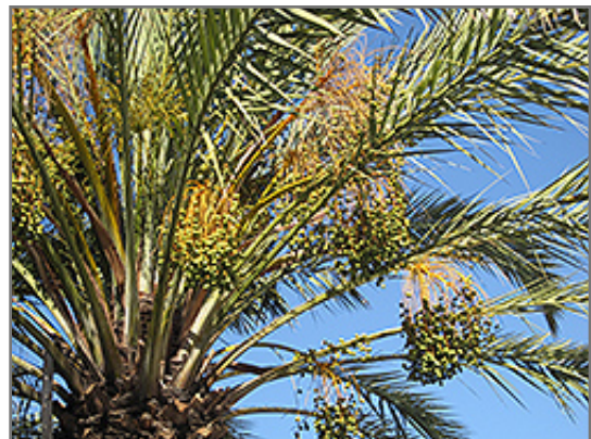
Date Palm fruit