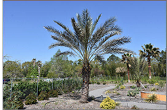
Date Palm

This tropical plant does best in full sun to partial shade. It does best in average to evenly moist conditions, but will not tolerate standing water. It is not particular as to soil type or pH. It is somewhat tolerant of urban pollution. This species is not originally from North America.