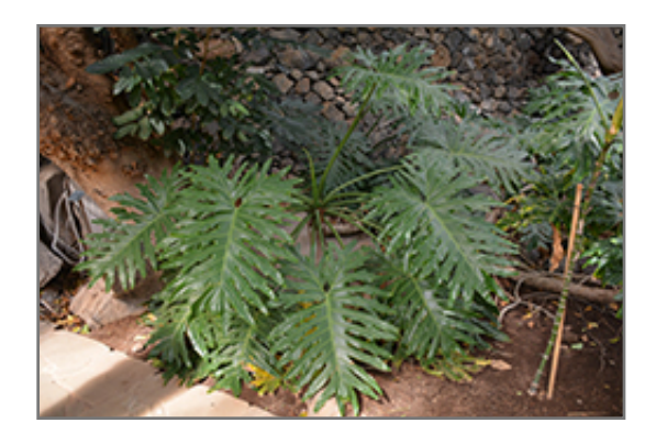
Tree Philodendron