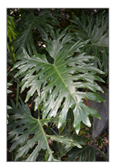
Tree Philodendron foliage

This plant is native to the tropics and prefers growing in moist environments with evenly warm conditions all year round. In our climate, it is usually grown as an outdoor annual in the garden or in a container. If you want it to survive the winter, it can be brought in to the house and provided with special care, and then returned to the garden the following season. In its preferred tropical habitat, it can grow to be around 15 feet tall at maturity, with a spread of 15 feet. However, when grown as an annual or when overwintered indoors, it can be expected to perform differently, and its exact height and spread will depend on many factors; you may wish to consult with our experts as to how it might perform in your specific application and growing conditions.