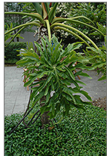
Tree Philodendron foliage