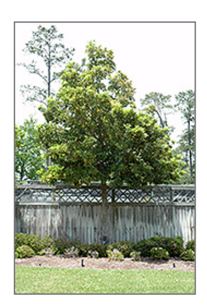
Tabu No Ki Tree