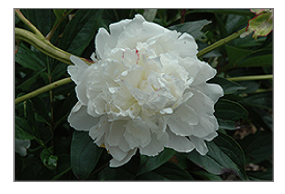
Festiva Peony flowers