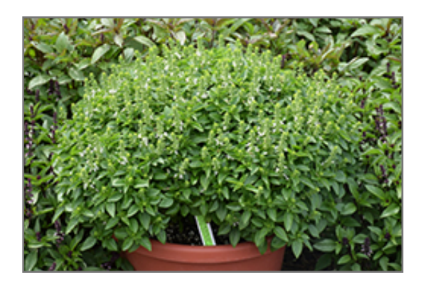
Spicy Globe Basil