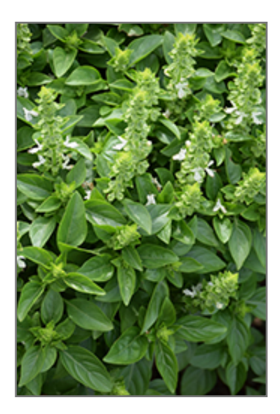
Spicy Globe Basil foliage

Spicy Globe Basil will grow to be about 12 inches tall at maturity, with a spread of 12 inches. When grown in masses or used as a bedding plant, individual plants should be spaced approximately 10 inches apart. This fast-growing annual will normally live for one full growing season, needing replacement the following year.