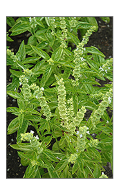
Genovese Emily Basil flowers

This plant is quite ornamental as well as edible, and is as much at home in a landscape or flower garden as it is in a designated herb garden. It should only be grown in full sunlight. It prefers to grow in average to moist conditions, and shouldn't be allowed to dry out. It is not particular as to soil type or pH. It is somewhat tolerant of urban pollution. This is a selected variety of a species not originally from North America. It can be propagated by cuttings; however, as a cultivated variety, be aware that it may be subject to certain restrictions or prohibitions on propagation.