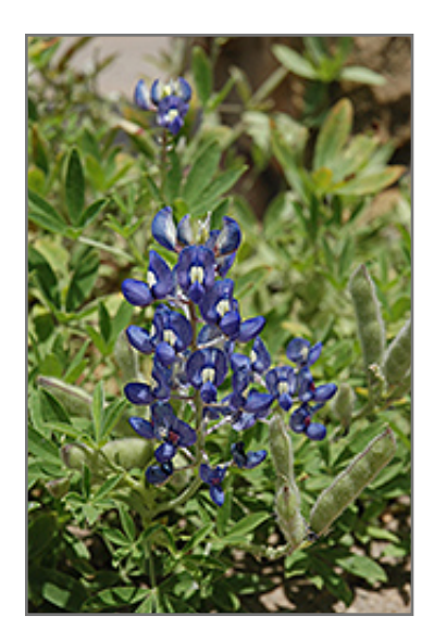
Texas Bluebonnet flowers

A native variety producing spikes of eye catching blue flowers with white centers; a tremendous visual impact massed in the garden, border plantings or in containers