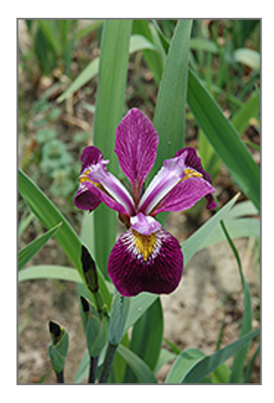
John Wood Blue Flag Iris flowers

An attractive variety, producing wide clumps of red-violet blooms with yellow signals in mid-spring; blooms for a long period; great massed in the garden or mixed border