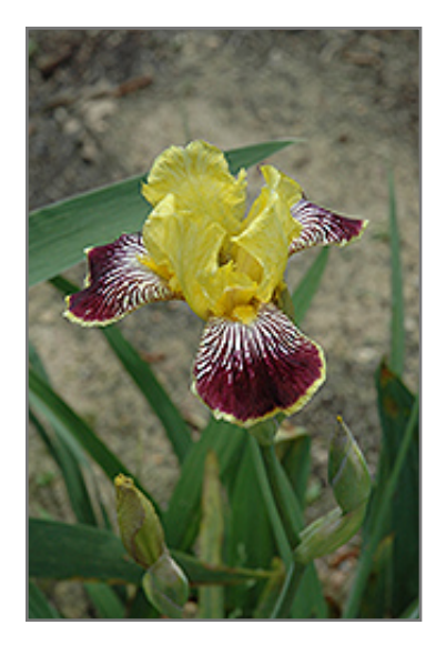
Welch's Reward Iris flowers

This vibrant miniature iris produces yellow standards, and falls with white hafts, burgundy centers and yellow edges; a stunning addition to the perennial border; also excellent massed in groupings in the garden; will quickly form dense colonies