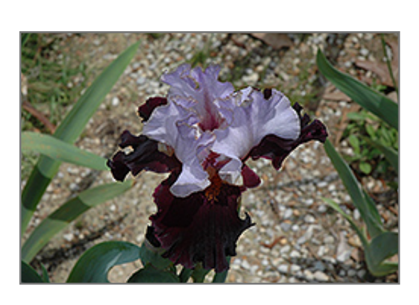
Vigilant Iris flowers

This vibrant iris produces pale blue standards with dramatic maroon-black falls and deep orange beards; a stunning addition to the perennial border; also excellent massed in groupings in the garden; will quickly form dense colonies