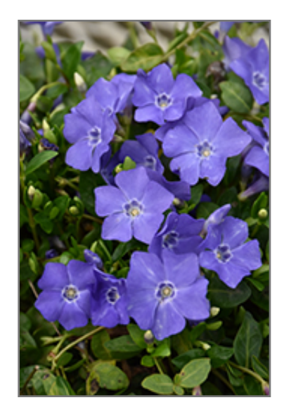
Bowles Periwinkle flowers

Bowles Periwinkle is an herbaceous evergreen perennial with a ground-hugging habit of growth. Its medium texture blends into the garden, but can always be balanced by a couple of finer or coarser plants for an effective composition.