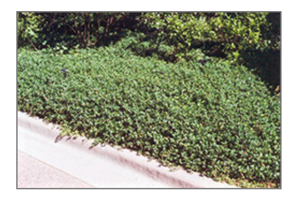
Bowles Periwinkle