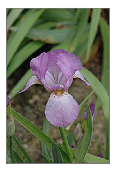
Think Spring Iris flowers

This interesting miniature iris produces pale violet-pink and white blooms with yellow beards; a stunning addition to the perennial border; also excellent massed in groupings in the garden; will quickly form dense colonies