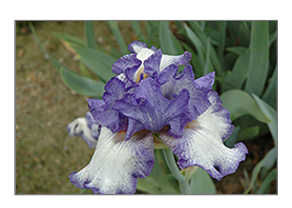
Soft Rain Iris flowers