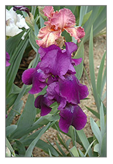
Sign Of Leo Iris flowers

This elegant iris produces spectacular violet-purple blooms, with white tipped bronze beards; a stunning addition to the perennial border; also excellent massed in groupings in the garden; will quickly form dense colonies