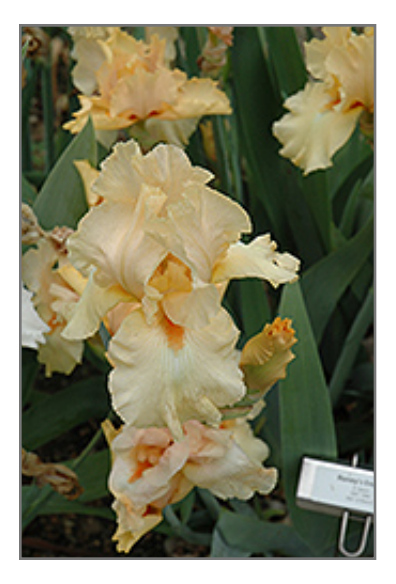
Roney's Encore Iris flowers

This elegant iris produces soft peach blooms, with yellow tipped orange beards; a stunning addition to the perennial border; also excellent massed in groupings in the garden; will quickly form dense colonies