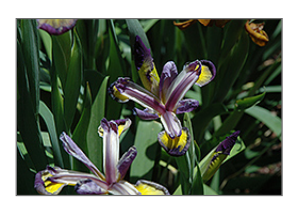
Respectable Iris flowers