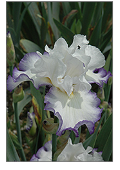
Queen's Circle Iris flowers

This regal variety produces white ruffled blooms, with light blue edged falls and orange-gold beards; a stunning addition to the perennial border; also excellent massed in groupings in the garden; will quickly form dense colonies