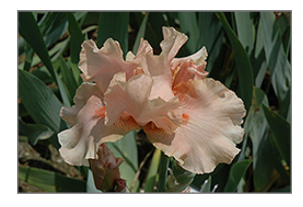
Pink Champagne Iris flowers