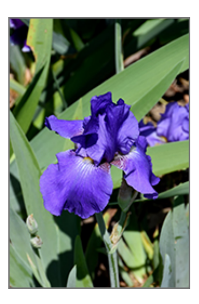
Oxmoor Hills Iris flowers

This outstanding variety produces violet standards, violet falls with white centers and gold beards; a stunning addition to the perennial border; also excellent massed in groupings in the garden; will quickly form dense colonies