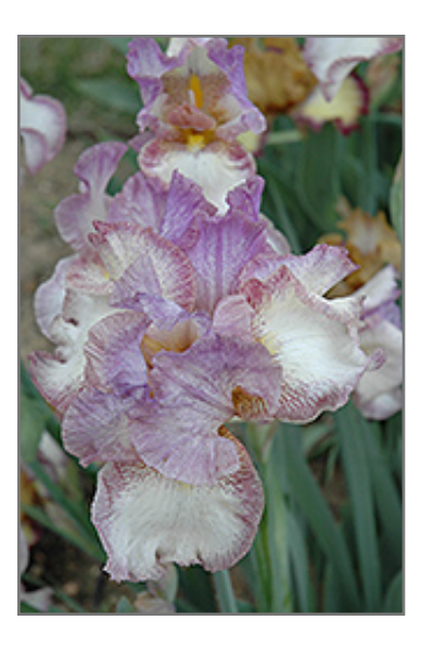
Northward Ho Iris flowers

This outstanding variety produces ruffled blooms of strawberry-violet plicata on white with golden beards; a stunning addition to the perennial border; also excellent massed in groupings in the garden; will quickly form dense colonies