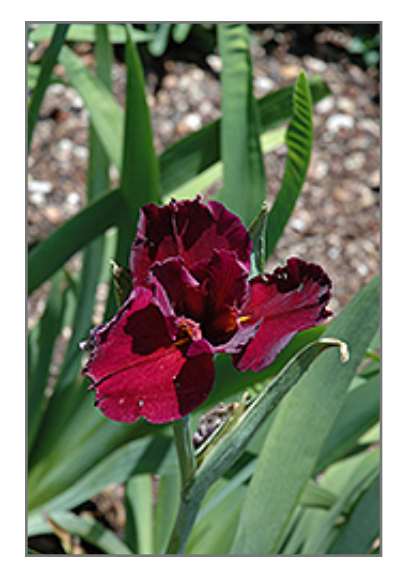
Neon Shadow Iris flowers

Neon Shadow Iris is recommended for the following landscape applications;