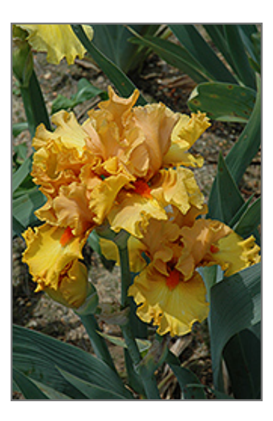
Nectar Of The Gods Iris flowers

This impressive iris produces luminous peach and gold blooms with dark orange-red beards; a stunning addition to the perennial border; also excellent massed in groupings in the garden; will quickly form dense colonies