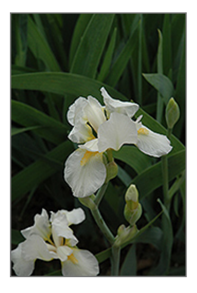
Mystic Crystal Iris flowers

Mystic Crystal Iris is recommended for the following landscape applications;