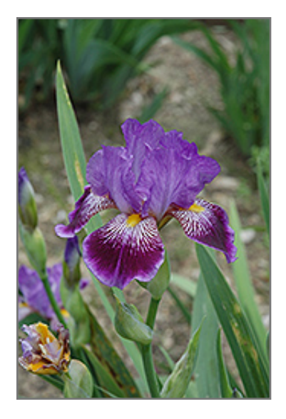
Missus Bee Iris flowers

Missus Bee Iris is recommended for the following landscape applications;