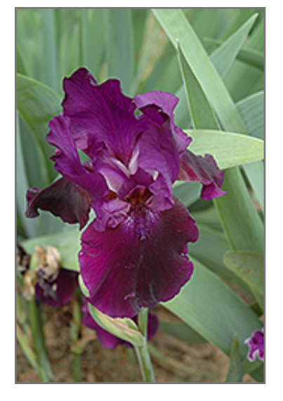
Midnight Caller Iris flowers

This impressive iris produces dazzling violet-purple standards with blackish deep purple falls; a stunning addition to the perennial border; also excellent massed in groupings in the garden; will quickly form dense colonies