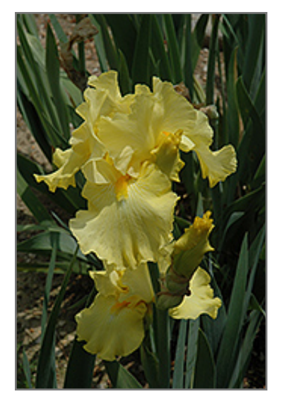
Mac Shawe Iris flowers

This attractive iris produces sunny, golden yellow blooms, with golden beards; a stunning addition to the perennial border; also excellent massed in groupings in the garden; will quickly form dense colonies