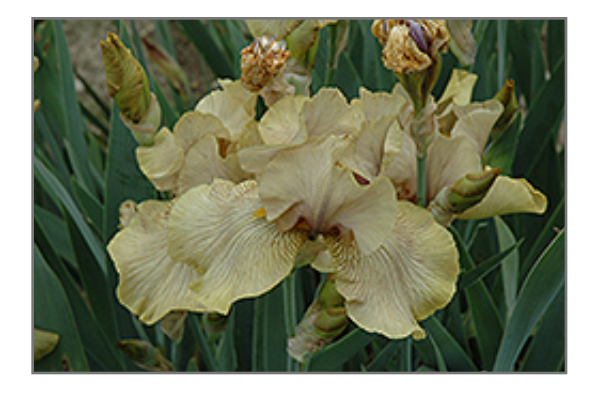
Lorna's Pride Iris flowers