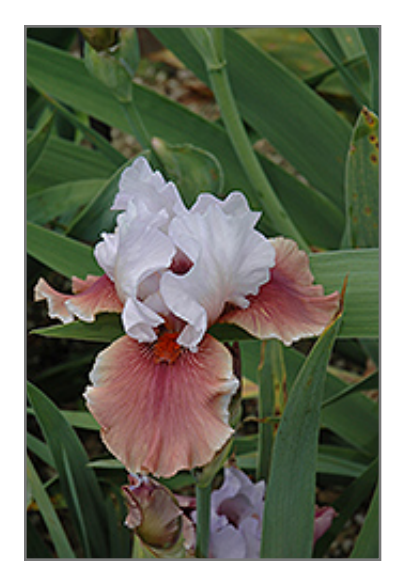
Leaps and Bounds Iris flowers

This outstanding iris produces white standards with a hint of blue, fuchsia-tan falls and tangerine beards; a stunning addition to the perennial border; also excellent massed in groupings in the garden; will quickly form dense colonies