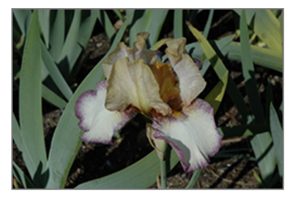
Las Vegas Iris flowers