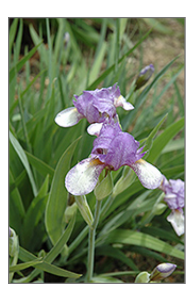
Larry's Girl Iris flowers

This interesting miniature iris produces violet spotted standards, with violet edged falls and yellow beards; a stunning addition to the perennial border; also excellent massed in groupings in the garden; will quickly form dense colonies