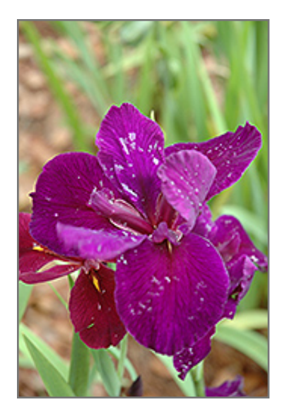
Jeri Iris flowers

Jeri Iris is recommended for the following landscape applications;