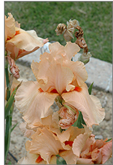
Frappe Iris flowers