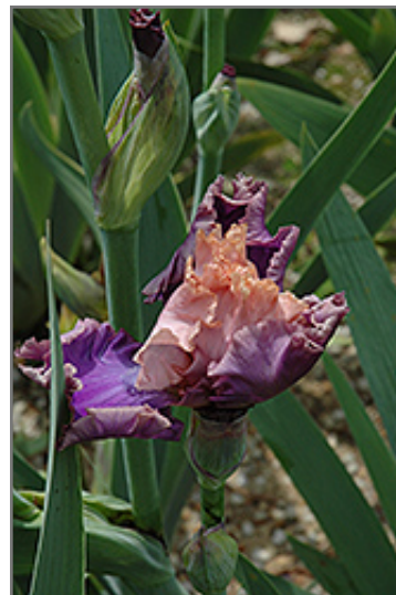
Florentine Silk Iris flowers