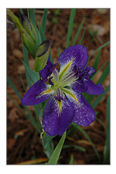
Flare Out Iris flowers

Flare Out Iris is recommended for the following landscape applications;