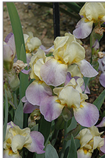
Enriched Iris flowers