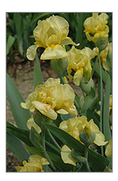
Easy Iris flowers

This interesting miniature iris produces butter-yellow blooms with darker yellow beards; a stunning addition to the perennial border; also excellent massed in groupings in the garden; will quickly form dense colonies