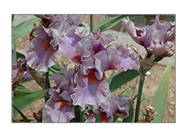
Dollar Iris flowers

This luminous variety produces blooms of light lavender-violet with silvery ruffled edges and orange beards; a stunning addition to the perennial border; also excellent massed in groupings in the garden; will quickly form dense colonies