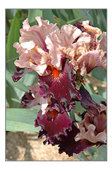
Disguise Iris flowers

This outstanding iris produces blooms of light rose-mauve, contrasted by striking deep burgundy falls and orange-red beards; a stunning addition to the perennial border; also excellent massed in groupings in the garden; will quickly form dense colonies