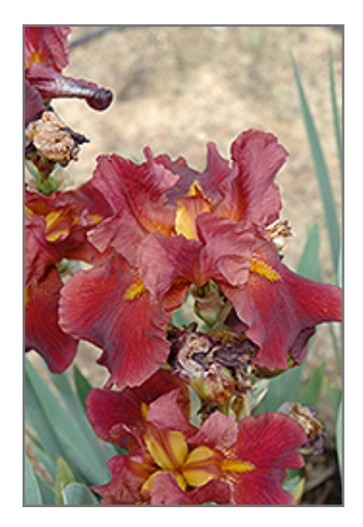
Coronation Of David Iris flowers

This lovely variety produces blooms of burgundy-violet with tones of red, with pale yellow centers and gold beards; a stunning addition to the perennial border; also excellent massed in groupings in the garden; will quickly form dense colonies