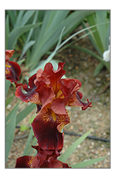
Chief Hematite Iris flowers

This interesting variety produces blooms of copper-brown, with deep red-burgundy falls and golden beards; a stunning addition to the perennial border; also excellent massed in groupings in the garden; will quickly form dense colonies