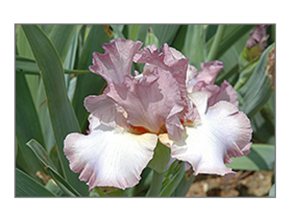
Blue Persuasion Iris flowers

This interesting iris produces lovely pale blue blooms, edged in pale lavender, with orange beards; a stunning addition to the perennial border; also excellent massed in groupings in the garden; will quickly form dense colonies