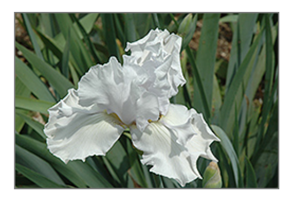
Battlestar Atlantis Iris flowers