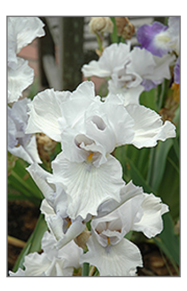
Aspen Iris flowers

This tall, interesting iris produces silvery white blooms with just a hint of pale blue; yellow tipped, orange beards; a stunning addition to the perennial border; also excellent massed in groupings in the garden; will quickly form dense colonies