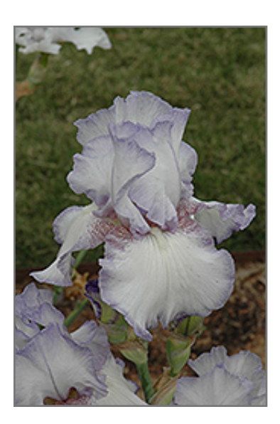
Amethyst Winter Iris flowers

This tall, interesting iris produces lovely violet and pale blue blooms with golden beards; a stunning addition to the perennial border; also excellent massed in groupings in the garden; will quickly form dense colonies