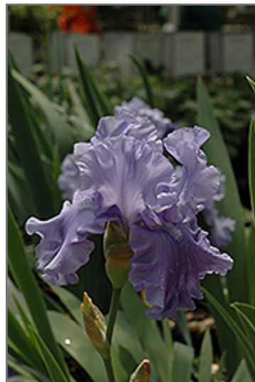
Abiqua Falls Iris flowers