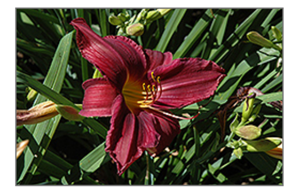
Zambia Daylily flowers