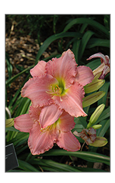
Vien Rose Daylily flowers

Vien Rose Daylily features bold rose trumpet-shaped flowers with lime green throats and a yellow flare at the ends of the stems in mid summer. The flowers are excellent for cutting. Its grassy leaves remain green in colour throughout the season.