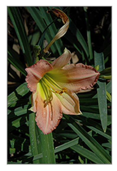
Tree Of Life Daylily flowers

Pretty peach-pink trumpets with yellow centers, pale lavender eyezones, and ruffled edges; great grassy texture and form; diploid; easy to grow and maintain; a showy addition to the garden or border